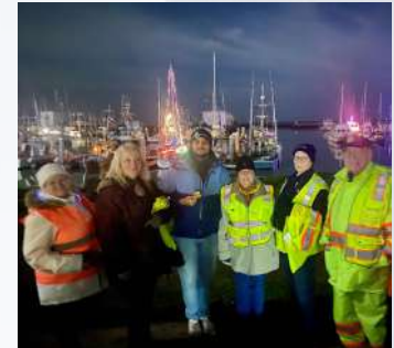
LaReine & George and members couldn't get enough chilly weather so they volunteered Dec 14 in the evening at the Lighted Boat Festival at Half Moon Bay.