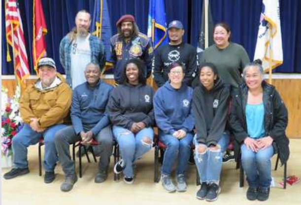
Int'l Nat. Brotherhood of Electrical Wkrs, Local 617