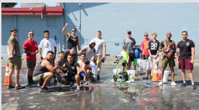
USMC 23d Regiment completes another carwash fundraiser.