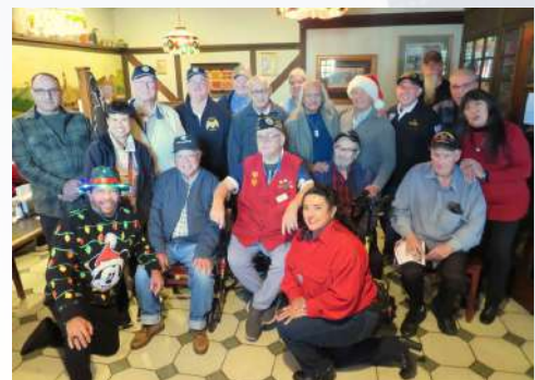
Post, AmVets, VVA, et al annual holiday lunch at Harry's Hofbrau

The Building Project has one major issue to be resolved--the $750,000.00 zero percent interest loan from Redwood City. If the project doesn't come to fruition, the loan will not be due for repayment until CalTrain or another entity wants to buy it. I'll have more information in the very near future.