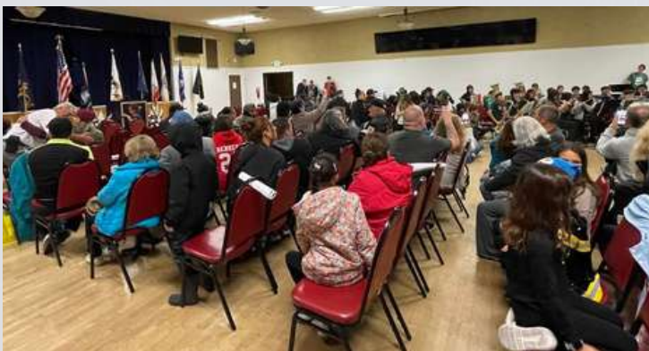
Members and the general public entertained by live music while awaiting the program commencement .