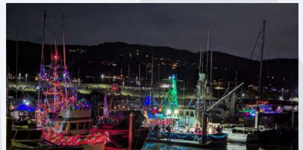
Lighted Boat Festival, Half Moon Bay: Andrew gave instructions, drones lit up the sky, and festival lighted boat contest.