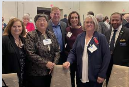
Some of P105 Family representing at the 9th SM County Veterans Commission Lunch