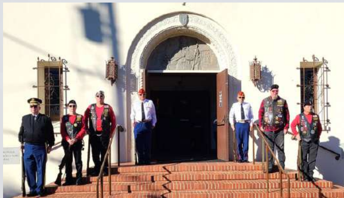
Honor detail for a Marine Vet: Firing Detail, Taps, folding and presenting the American flag to the family.