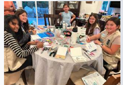
Foster City GS Scouts voted to create holiday cards for VA patients.