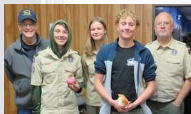
Thanks to Scouts of America who guided attendees from Courthouse Square to the Post 105 due to rain.