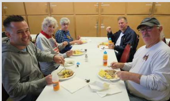
Enjoying a hearty SOS Breakfast