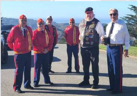
A moment of rest for the Riders and Marine Corps League after the commemoration at the gravesite of the first Marine SGM laid to rest at Skylawn Memorial Park.