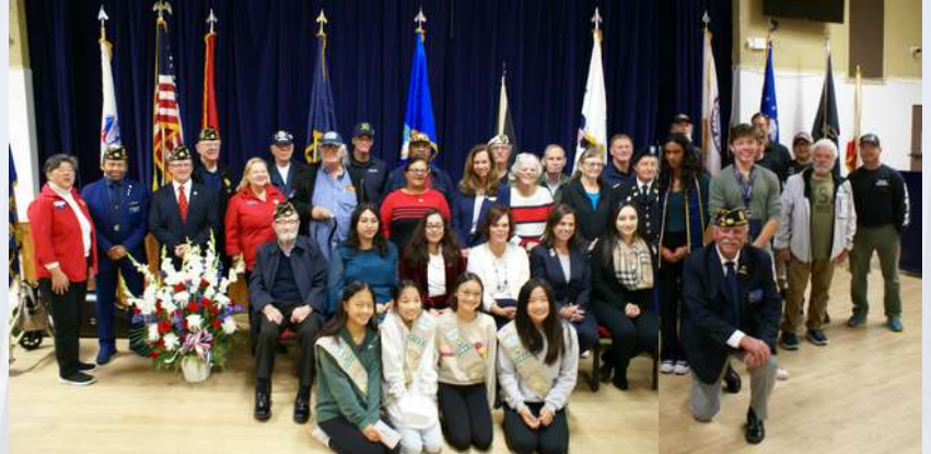
American Legion Post 105 RWC Family & Guests