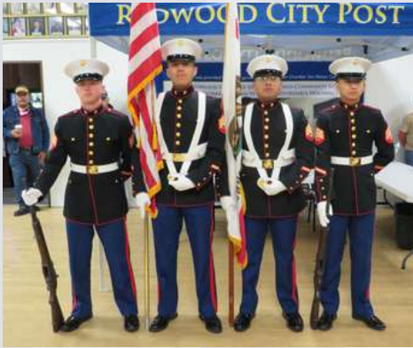
U.S. Marine Corps 23d Regiment

With a rain forecast, P105's Ceremony Team pivoted and moved the entire day's event to the Post without a hitch. Outdoor facilities were canceled, dignitaries informed, and the Post readied for the Monday ceremony. Newark Wind Symphony and Kennedy Middle School entertained with inspiring & patriot tunes.