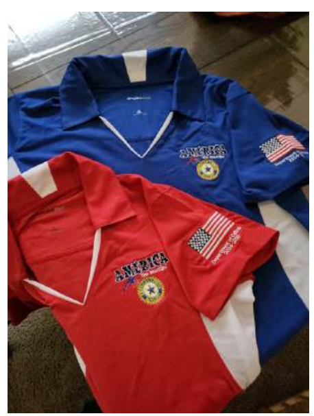
Shirts are $40 each. Details on how to order will be on the department website soon.