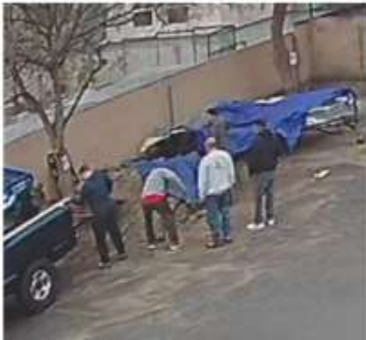
Strong backs and much volunteer time got it done — shovel full by shovel full.

The plumbing has been repaired and everything is flowing downhill. All the dirt from the trench in the parking lot has been removed and the lot is almost back to normal.