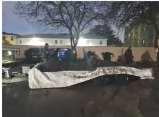
They worked into the night to load the trailer that took away the excess dirt.

The plumbing has been repaired and everything is flowing downhill. All the dirt from the trench in the parking lot has been removed and the lot is almost back to normal.