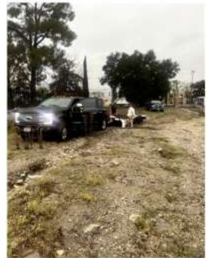
A safe space was found to unload the excess dirt. The next day, the trailer was un-loaded — shovel full by shovel full.