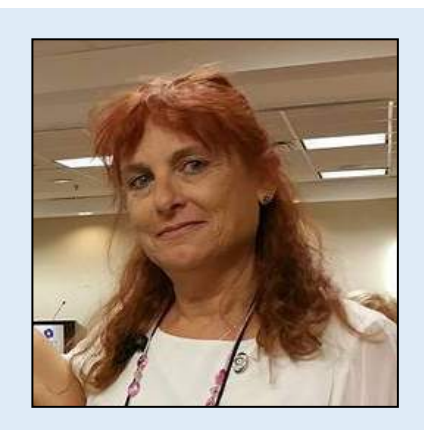
American Legion Auxiliary Department of California's 101st Convention was dedicated in loving memory to

ALA National President ALA Girls Nation ALA Girls State ALA Juniors