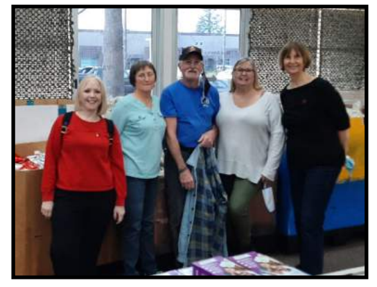
ALA Unit 383 at the Move America Forward Warehouse

MAF is a nonprofit military charity based in Sacramento, California and is the nation's largest grassroots pro-troop organization dedicated to supporting the brave men and women of our Armed Forces. Their principal mission today is to provide care packages and letters from grateful Americans to the troops deployed in combat areas around the world.