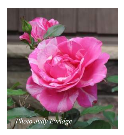
Happy Mother's Day