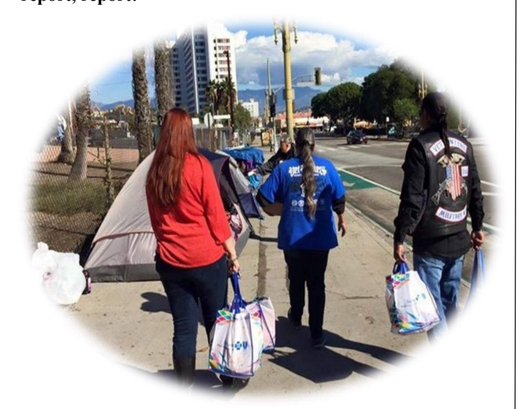
Allied Unit # 302, District 17 taking care of homeless veterans above the 101 Freeway

You will find that with Community Service, many of your efforts can be reported in more than one program. Choose the program report that best describes your efforts and then report , report , report !