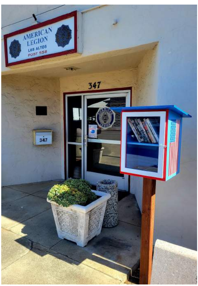
Los Altos Little Free Library

Since last September the Little Free Library installed in front of Los Altos Post 558 in District 13 has been going strong. We cleaned out our Post and homes and started putting books in the