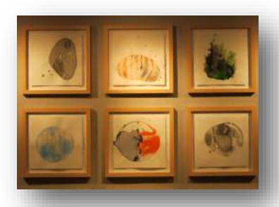
Saint Kate Art

Milwaukee or Wisconsin in general never the Hilton to celebrate the 50<sup>th</sup> made it to my bucket list of places I wanted to visit, even though "On Wisconsin" was the tune of my school fight song! What a very pleasant surprise it was to find such a charming, friendly, and interesting city to explore once I arrived.