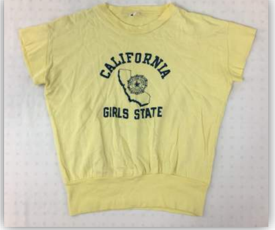
Vintage 50's California Girls State American Legion Auxiliary T-shirt (EBAY)

What hasn't changed over the years is the mission of our program. Each citizen of ALA California Girls State expands their understanding of civic responsibility, love of country, and service to their community. They gain confidence as they try new things. They build a circle of friendship that includes all the ALA California Girls State citizens who came before them. They are empowered to be their best selves.