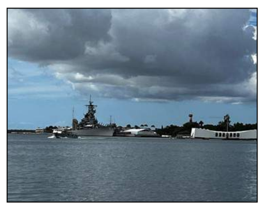
View of Pearl Harbor from tour boat

The boat docked. As my husband and I walked from the little pier towards the