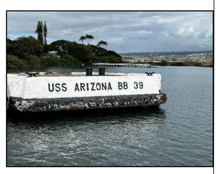
Rear end of Memorial