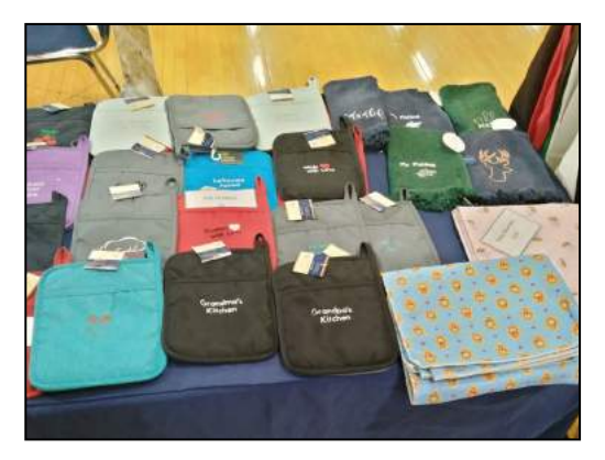
S hasta Unit 197 held a Community Yard Sale in July. Community members were able to sell their goods in a nice cool environment.