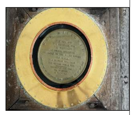
USS Missouri—upper deck where Japanese surrendered