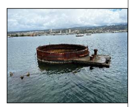
Turret with concrete markers in background