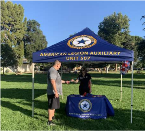
Items like the specially-ordered pop up tent provided by the ALA Foundation Mission in Action Grants help branding efforts in the community.

Mission in Action grants were effort. established to assist units and departments with increasing brand awareness — one of the five goals in the American Legion Auxiliary's 5-Year Centennial Strategic Plan. That plan was completed in 2019. With the COVID-19 pandemic causing units and departments to cease meetings, there were few applications for Mission in Action grants.